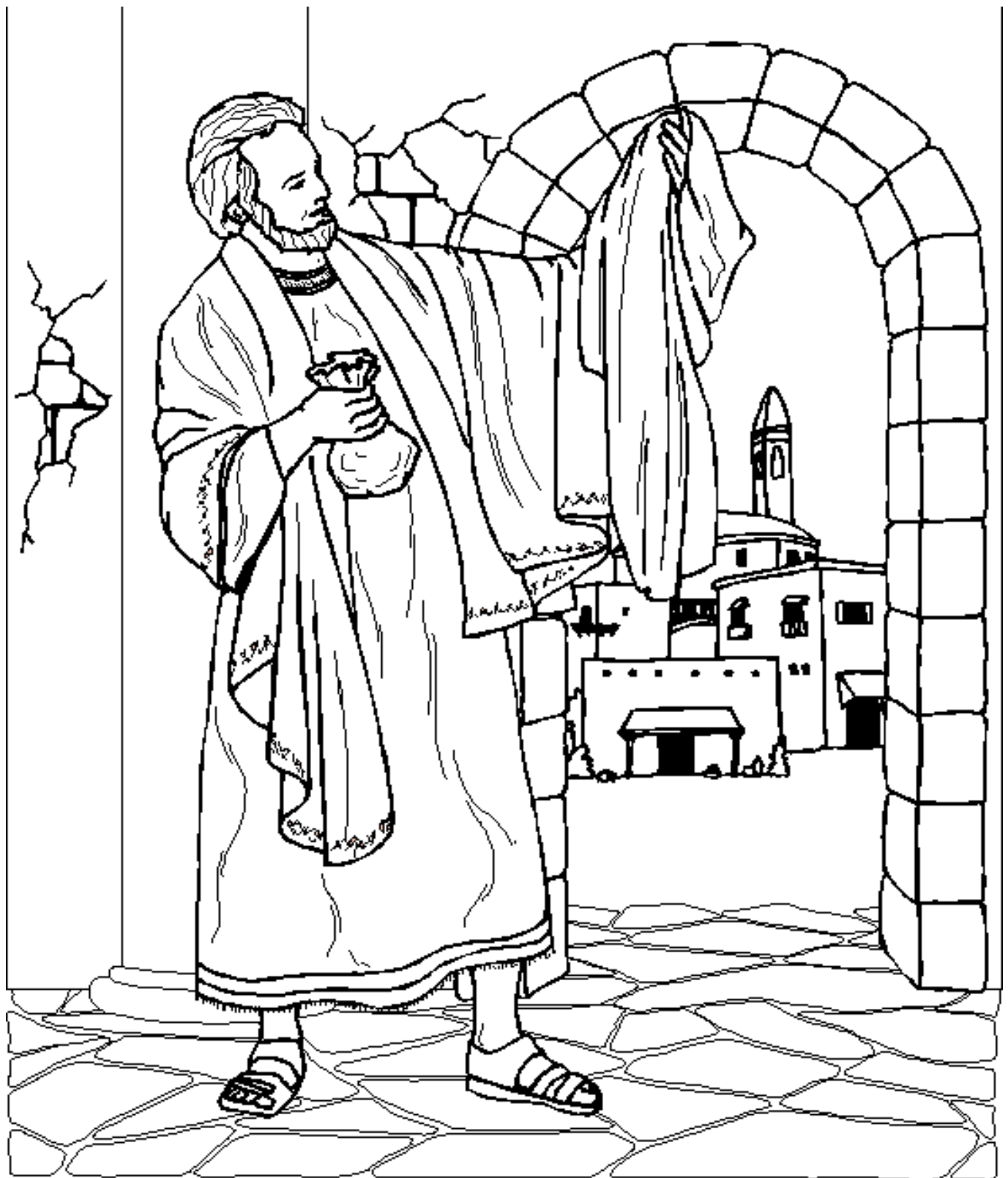
The parable of the rich fool

31 July 2022, the Seventh Sunday after Trinity; Luke 12:13-21